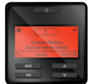
Red: Indication of UPS alarm that requires immediate attention