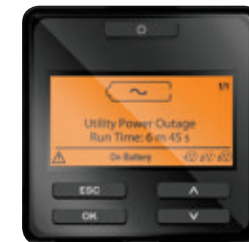
Backlit screens: Amber: Indication of condition that requires attention